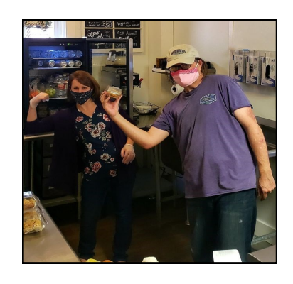
We have been blending up some delicious fruit smoothies in the Café.