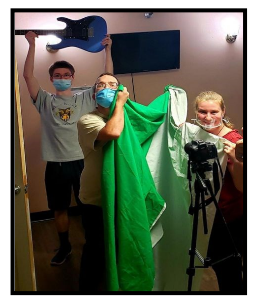
Young adults working on a media project.

Building a bright future for members 18-25 years old.